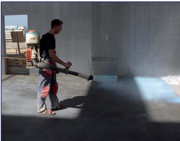
Aquacure being applied by Mist Blower in Romania

Over the recent past the awareness when using solvent based materials has been questioned. Developments have taken place to replace the solvent-based materials with water-based materials and Permaseal have developed Aquacure and Aquacure PUA to meet this challenge.